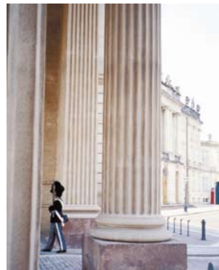
Guard at Amalienborg Palace, residence of the royal family.

As the capital of Denmark, Copenhagen is a relatively large and lively city, yet it retains a charming small-town atmosphere that is instantly appealing.