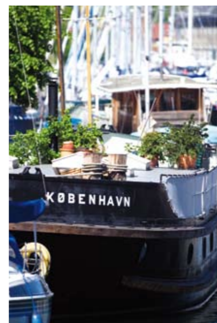
A houseboat docked in the inner harbor.

Who are the Danes? At Copenhagen's National Museum, you can follow the history of the Danes from the rune stones of the vikings to the present day. The exhibitions depict everyday life and special occasions throughout the ages in Denmark, and also feature the many and varied lifestyles witnessed throughout the last 900 years. Copenhagen's excellent infrastructure makes it easy to take short trips beyond the city to get a feel for both ancient