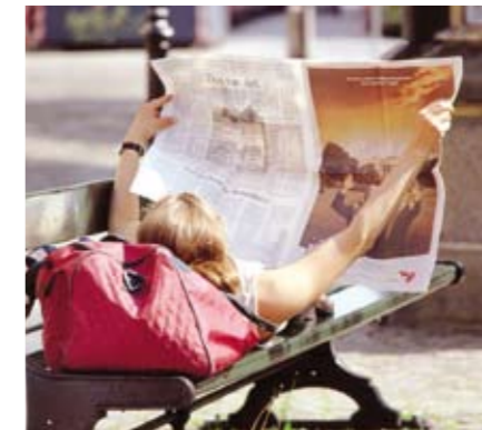
Relax in one of Copenhagen's many oases.

combine Copenhagen experiences. Fine food is a broad concept in Copenhagen. Many locals would claim the classic hot dog stands in this category. For a slightly more sophisticated but truly local experience, the city offers several great restaurants where visitors can experience Denmark's famous open-faced sandwiches, better known as smørrebrød. The city center is full of cozy sidewalk cafés and boasts several Michelin-starred restaurants.