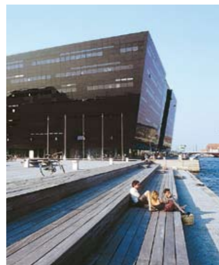
Architecture on Copenhagen's waterfront – The Black Diamond.