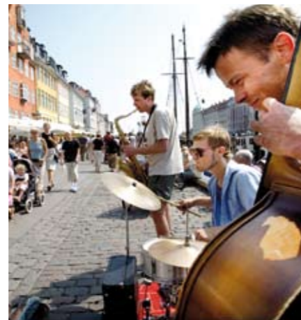
Copenhagen Jazz Festival runs 10 days every year in July.

The historic experiences offered by Copenhagen's past are complemented by spectacular modern gems of architecture that you can easily explore on your own. Built as an extension to the old Royal Library, the Black Diamond is a stunning black granite building overlooking one of the downtown canals, which can be reached by waterbus and on foot. Just a few more stops on the waterbus and the new Opera House can be experienced inside and out, or while enjoying refreshments in the Opera café or relaxing on the adjacent open area. Copenhagen is renowned as one of the world's premier design capitals and Danish design has an unmistakable presence all over town; however, the Danish Design Center, located directly across from the Tivoli Gardens, is a great way to experience most of it in a short period of time.