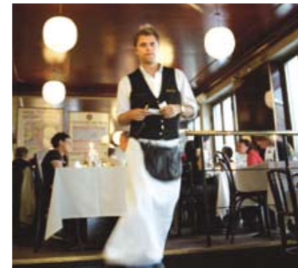
Copenhagen offers a pulsating café life.

Copenhagen offers the world's longest network of pedestrian and shopping streets and squares. From designer shops and brand names galore along Strøget, to small quaint boutiques in the narrow side streets, antique shopping in Ravnsgade and the more upscale St. Kongensgade – shopping while strolling is a great way to