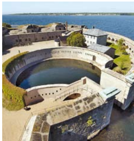
The Fortress of Kungsholmen.

In 1679, Swedish King Karl XI traveled among the islands that today form Karlskrona. Sweden was a superpower in those days and needed an