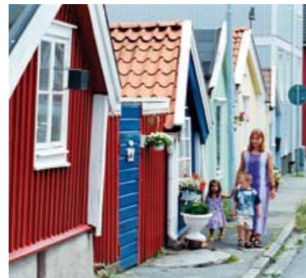
Small and picturesque cottages at Björkolmen.

Karlskrona attracts Swedish and foreign tourists all year round. The beautiful archipelago offers activities such as sailing, bathing and fishing. Many tourists also visit Karlskrona because of its status as a Unesco world heritage maritime town, a distinction it was awarded in 1998. You'll learn more about the world heritage concept by going on one of the many guided tours. Knowledgeable, multilingual guides will recount the town's history and point out buildings and sites of special interest. Tours can be taken on foot, by bus or on board one of the archipelago boats that depart from Fisktorget. In early August the annual Sail Karlskrona festival is held. The people of Karlskrona, together with tens of thousands of tourists, gather on the quays to party and watch or sail with the many impressive sailing boats taking part. Another important annual event is the Lövmärknaden market, held at Stortorget on the day before Midsummer's Eve, a date popularly known as Karlskrona's national day. During the summer, two high-class chamber music festivals are held as well as other concerts, often in unique environments. If you feel like bathing or basking in the sun, just a few minutes' walk from downtown Karlskrona is the small island of Stumholmen, popular with locals. Here you'll also find the Naval Museum with its impressive collec-