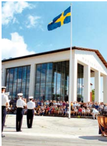
The Naval museum and The Royal Swedish Navy Band.

A statue of the town's founder, King Karl XI, after whom the town is named, can be seen at Stortorget. Members of the present royal family are regular visitors to Karlskrona.