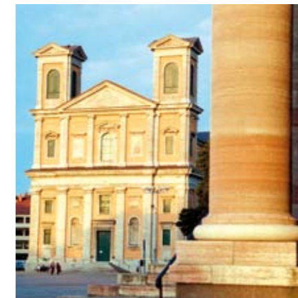
The Great Square, one of northern Europe's largest, with Fredrik Church and the Church of the Holy Trinity.

magnificent churches designed by Nicodemus Tessin, the Italian-inspired architect who also designed the Royal Palace in Stockholm. Close by at Kungsbron is Amiralitetstkyrkan, a wooden church built in 1685 with the famous Old Man Rosenbom statue outside. Admiral Henric af Chapman's summer residence from 1785, Skärfva, is a unique creation located 10 minutes from downtown and easily accessible by bus and boat.