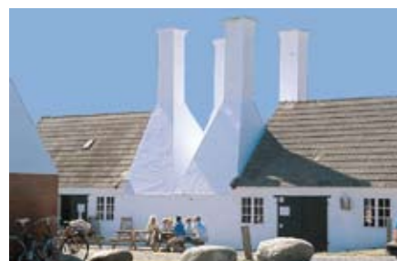
The smokehouses demonstrate in practice how herring has been smoked on Bornholm through the ages.

Denmark's easternmost island of Bornholm is a craggy, 587 square kilometer large rocky landmass with a rich, fertile heart. Bornholm is a true paradise, with a great variety of scenery ranging from cliffs and skerries to woodland, heather and miles of sandy beaches.