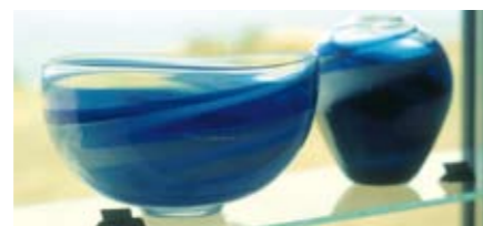
Arts and crafts are alive and flourishing on the island of Bornholm.

Rønne is the capital of the island, and the town square is a living center where guests and locals gather round the fountain, the granite sculpture, and in cafés and shops. In downtown Rønne you will find a wide choice of specialist shops – fashion wear, gold & silver, gifts, shoes, books, hairdressers, hardware, bakeries, a cheese shop etc. Beyond Rønne, Bornholm offers excellent opportunities for hiking and cycling, with terrain ranging from rugged coastline and sandy beaches – the miles of pristine sands at Dueodde are rated one of the finest beaches in the whole of Denmark – to undulating landscapes and forested interior. For the sports enthusiast, there are four excellent golf courses within easy reach of Rønne, while sailing offshore gives a fascinating new perspective