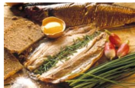
If you are visiting Bornholm in search of gastronomic delights, you have come to the right place.

Rønne has several high-quality fashion shops, with ranges different from those found in major city centers. You can have beautiful one-off evening gowns tailored in silk, and shops specializing in tailored children's wear are also gaining a foothold on Bornholm. The island is famous for its glassblowers and ceramicists, and many workshops are open to visitors. The workshops provide ample opportunities to watch the artistic process and buy works of art. Check out the textile artists, weavers and woodworkers, too.