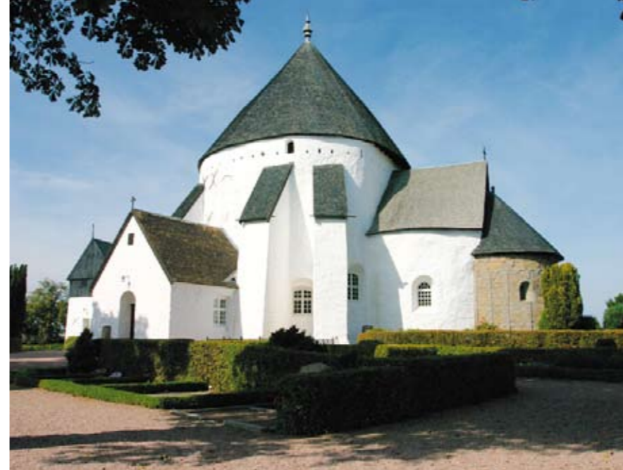
Østerlars Round Church is the best known and largest church on Bornholm.

It's exciting to go in search of the past on Bornholm, whether you're interested in the genesis of the island or the traces left by our