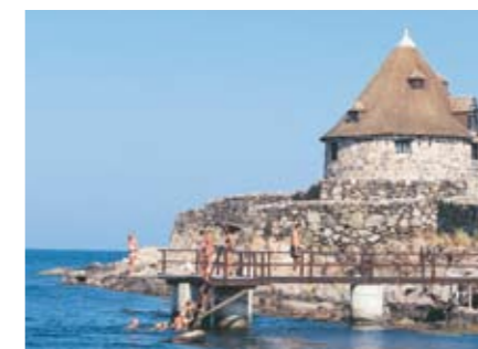
The easternmost point of Denmark is Christiansø – a unique place with no cars and only about 100 residents.

The most fascinating traces left by the people of the Bronze Age on Bornholm are the many carvings cut into the rocks and cliff faces. They are thought to have had a religious significance, but as yet not much is known about them. The best examples are found in the north of the island. In the past, the island's central location in the Baltic made it an important intersection for trade routes throughout the Baltic Region. In the viking era the island was subject to hostile attacks from neighboring countries, and the church architecture of the period reflects the need to protect people and property. The four characteristic round churches – Østerlarskirke, Olskirke, Nykirke and Nylarskirke – and a number