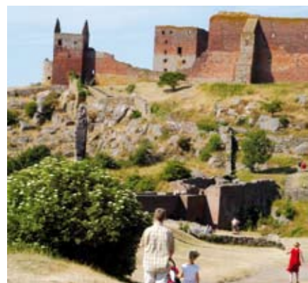
Built in the early 12th century, Hammershus is the largest castle ruin in northern Europe.

Bornholm is home to northern Europe's largest castle ruin – Hammershus, which was laid out as a virtually impregnable fortress capable of withstanding lengthy sieges. Until the mid-15th century, Crown and Church were in conflict in Denmark, and control of Hammershus – and