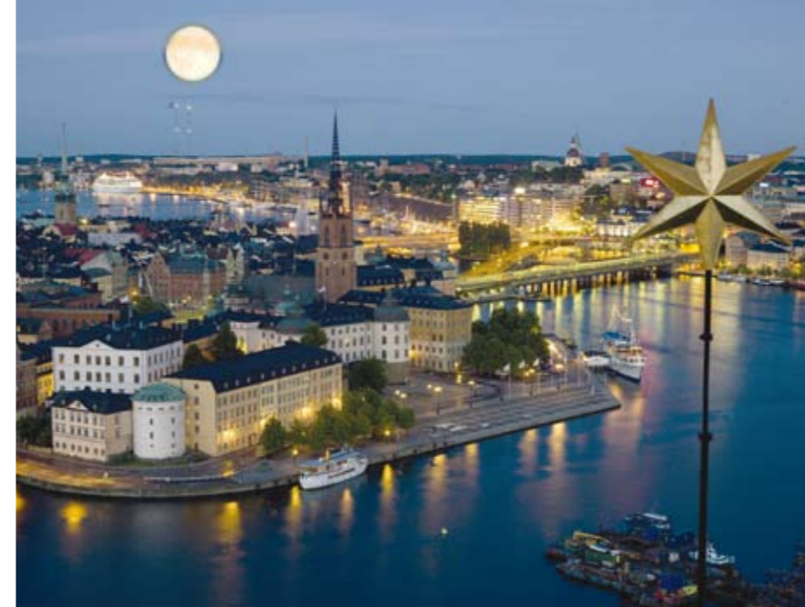
Stockholm's beauty on water is unparalleled.

Shopping was never so easy with so much variety to choose from. Just a short walk from the quay, you can wander through the historic district of the Old Town, with its cozy souvenir shops nestled along quaint cobblestone streets. If your passion is high fashion and well-known designers, you'll love the area known as Östermalm. For easy one-stop shopping, try the cosmopolitan department stores such as NK,