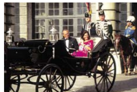
Stockholm has been the seat of royal power for centuries.

Gamla Stan – Old Town – is a medieval island in the center of the city, and home to the Royal Palace, several beautiful churches, narrow picturesque streets, and an abundance of shops, restaurants and cafés, all within easy reach of the quay. Sweden has been a monarchy for over 1,000 years and Stockholm has been the seat of royal power for centuries. The Royal Palace complex, with museums such as the Royal Armory, the Royal Treasury, the Royal Mews and even a daily changing of the guard ceremony in the outer courtyard, offers great opportunities to get to know our regal heritage first-hand. History lovers can take a range of guided city tours offered in many different languages. The city and surroundings are rich with royal heritage as well. Parks, gardens and palaces such as Drottningholm Palace – the residence of the Royal Family and a UNESCO World Heritage site – are open to the public.