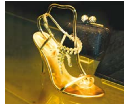
Stockholm is worth visiting for the shopping alone. Be the first to find the latest in design and fashion.

Åhléns or the indoor Gallerian mall. Drottninggatan is an outdoor pedestrian mall that connects the Old Town with the more modern heart of the city, a wonderful stroll with a variety of shops and boutiques.