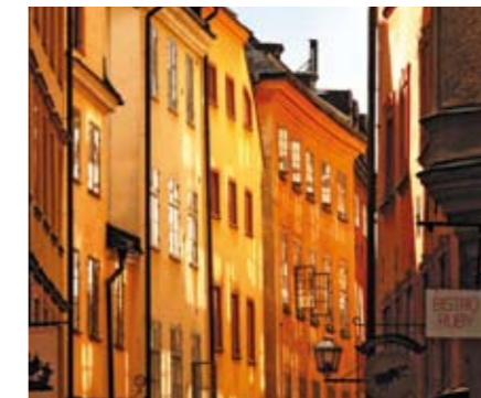
The best preserved Medieval Centre in Northern Europe.

the Vasa warship that sank on her maiden voyage in 1628, is another popular attraction. Long before Stockholm was founded, the area where Lake Mälaren meets the Baltic Sea was a lively region of Viking commerce. Today the many rune stones in the Stockholm surroundings bear evidence of the Viking Age and its people. A visit to the UNESCO World Heritage Site of Birka, a true Viking settlement, gives a picture of our ancient past.