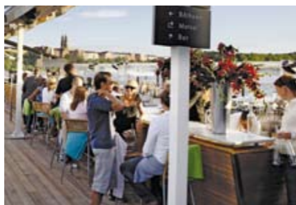
Dining out in Stockholm is a culinary experience - a good restaurant is never far away.

High-tech, modern infrastructure and convenient, efficient transportation ensure smooth sailing in Stockholm. Many of our 9 quays are located within walking distance of the city center, providing ease, convenience and variety. Journey through the world's longest art gallery – the Stockholm subway, a clean and colorful mode of public transportation with over 90 stations uniquely decorated by national artists – en route to the city's many museums. Enjoy the National Museum, with its exhibit showcasing Swedish design by decade, or perhaps the Moderna Museum of contemporary art, also the site of the annual outdoor International Jazz Festival.