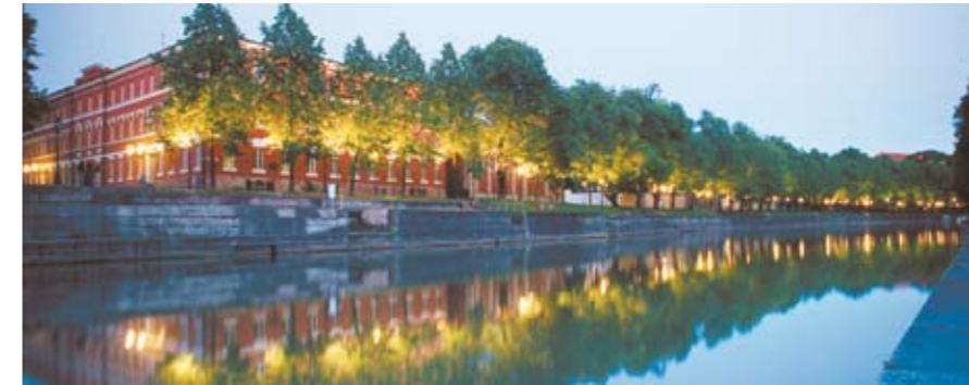
A lovely night time view over the River Aura towards the Old Great Square.