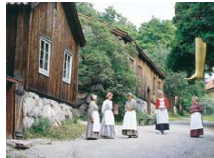
The old wooden houses saved from the Great Fire in 1827 can be seen at the Handicrafts Museum on Luostarinmäki Hill. During the summer season craftsmen give work displays.

Experience urban city life by taking a walk along the River Aura from the cathedral to the castle, Turku's two main landmarks. For locals and visitors alike, the lively riverbanks are the places to see and be seen. Visiting one of the riverboat restaurants is also highly recommended. The historical side of the city can be experienced on Luostarinmäki Hill, in the old quarter of Turku.