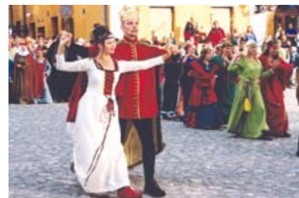
The yearly Medieval Market offers four days of happenings mostly at the Old Great Square.

tural triumph is St. Henrik's Ecumenical Art Chapel, which was consecrated in 2005. It is situated on Hirvensalo Island and integrates perfectly into the surrounding nature. The design of this building, Ikthys, resembles a fish or a boat. The chapel has gained much attention worldwide.