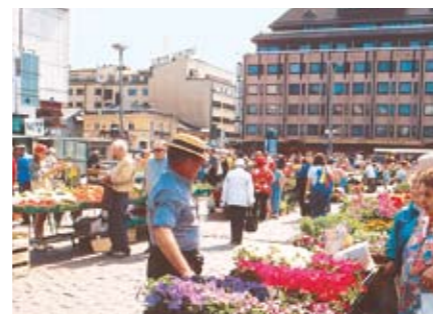
A colorful market place attracts both visitors and locals.

Turku offers both urban and rural life. In the downtown area there are good shopping possibilities, a variety of cultural happenings, restaurants, cafés and also peculiar pubs like the Old Bank, and Pharmacy, School and Toilet. Right outside the city there are excellent opportunities for fishing in the breathtakingly beautiful archipelago, golfing by the seaside, swimming, canoeing, biking, hiking etc. Ruissalo Island, only 5 kilometers from downtown Turku, offers a charming and relaxing environment for travelers and locals alike. It is famous for its unique nature, with old oak trees, versatile flora and fauna. Closer to the city is Kupittaa Park, Finland's oldest and largest urban park. It offers a range of activities and amusements for adults and children. One of Turku's two outdoor swimming pools is in Kupittaa.