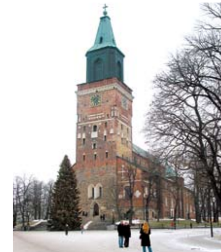
The Medieval Cathedral of Turku - Finland's national shrine and an important landmark of Turku.

and has specialized technology units such as BioCity, DataCity and ElectroCity, to name just some. Shipbuilding has always been an important industry and is currently enjoying a strong boom. The world's biggest cruise vessels are built in Turku. The three universities and numerous other schools, attended by students from all over Finland and around the world, give the street scene an energetic and youthful boost.