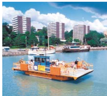
"Föri" – a small ferry boat that crosses the River Aura – is a Turku phenomenon. The river crossing takes only 90 seconds.

Turku has seen many architectural styles. In the 1930s, architects Alvar Aalto and Erik Bryggman left their mark on Turku and attracted international interest by designing functionalist buildings, a new trend at the time. Examples of their architecture, such as the Chapel of the Resurrection and Turun Sanomat Newspaper House, still attract people today. Turku's latest architect-